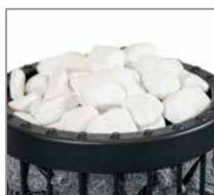
Decorative stones, ø 5-10 cm, AC4000