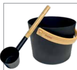
Sauna bucket & ladle set SAC1011