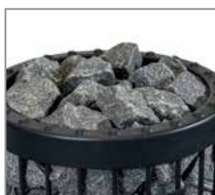
Heater stones, ø 10-15 cm, AC3020