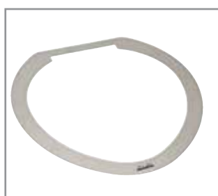
Embedding flange HAF1